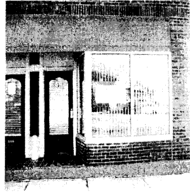
Current Central Office 280 N Main St.