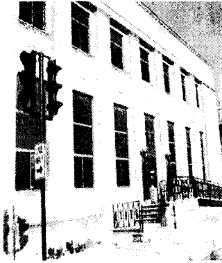
1st Central Office 1st and Macy Old Post Office Bldg.